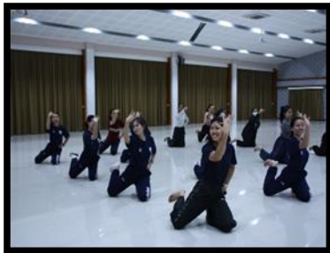
Figure 13: Dance practice of first year students in the course "Civilization and Local Wisdom."

5. General education foundations- It is a study in general education that helps in promoting cognitive skills, reasoning and creativity, such as civilization and local wisdom, Religion and Philosophy, systematic thinking process development and Learning by activities.