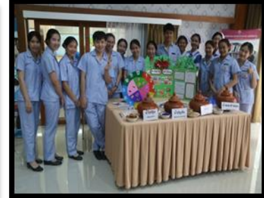
Figure 15: 4 th year students presented the facade of herbs in the subjects "Learning by activities."

6. Learning to live and living to learn- It is a complementary curriculum that promotes learning, respect for human values, through voluntary activities in the community supported by a school's club. The club's activities consist of 5 disciplines: 1) Academic and Information Technology Club 2) The club preserves arts culture and local wisdom 3) Moral Ethics Club 4) Sports and personality development Club and 5) volunteer club.