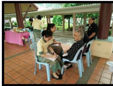
Figure 14: 2 nd year students working with the elderly people in the Elderly Health Promotion Center .