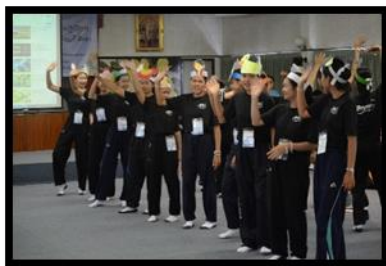
Figure 4. Preparatory activities for 1 st year nursing students