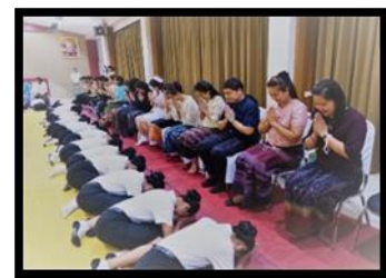
Figure 3 :Traditional dating destiny. Lanna people believed that the ritual will help agencies renew their own relatives and longevity.

2. Social climate- It is the preparation of learning before entering higher education. Students are ready to study and practice the profession after completing the undergraduate curriculum. During this process, there is a system of student care with counselors, caregivers, and a system of senior generation that help senior caregivers. With this, students feel secured at the same time they learn to respect each other including the younger generations.