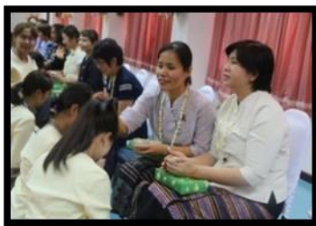
Figure 1 :On Songkran Festival we expressed our respect to our elders by pouring scented water onto the teacher' hands.

1. Student personality development – It is the development of good self-image, ethical, emotional development that promotes confidence. Students are encouraged to take part in the community's social activities, such as attending religious activities.