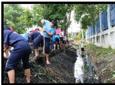
Figure 16: Spiritual volunteer pooling around the college.

6. Learning to live and living to learn- It is a complementary curriculum that promotes learning, respect for human values, through voluntary activities in the community supported by a school's club. The club's activities consist of 5 disciplines: 1) Academic and Information Technology Club 2) The club preserves arts culture and local wisdom 3) Moral Ethics Club 4) Sports and personality development Club and 5) volunteer club.