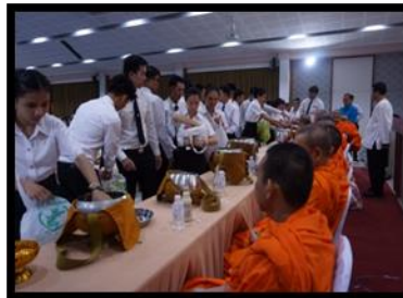
Figure 17: Moral Ethics Club, Sports Club which preserves culture; and local wisdom club which organizes religious activities on holy days.