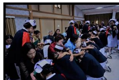
Figure 12. Graduation ceremony, which the parents congratulated them.