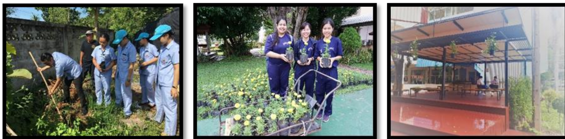
figure 19-21 : Teachers and students create an environment within the college.