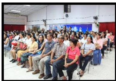
Figure 10. Annual Parent Meeting Conducted to inform about the issues of students' living, student achievement problems in learning, etc.

4. Family and community involvement- It is the involvement of parents in strengthening the mind to develop respect for human values, such as the annual parent-teacher meeting. Parental involvement in student day activities such as capping and pinning ceremony, graduation and community involvement around the college to promote access to and learning of social cultures such as community activities.