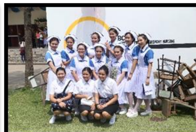
Figure 6. A system of senior generation on students where the lower years will have the same adviser with the higher years.

of intellect. Students use the process of self-discovery, adaptation, and growth. They also have independent thoughts and become sensitive to other person's feelings. Students acquire a greater understanding of humanity.