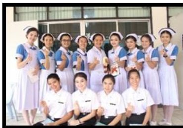
Figure 5. Student counseling system is available for approximately 12-15 students.