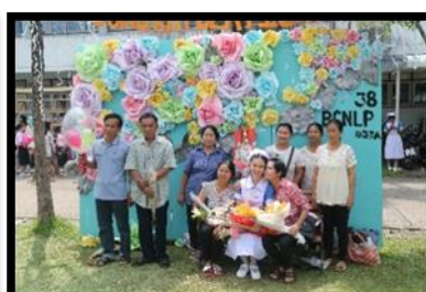
Figure 11. 2 nd year students received their caps in the capping ceremony, which the parents congratulated them.