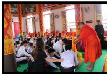
Figure 2 .Candle parade is a traditional Buddhist on the Rains-Retreat.