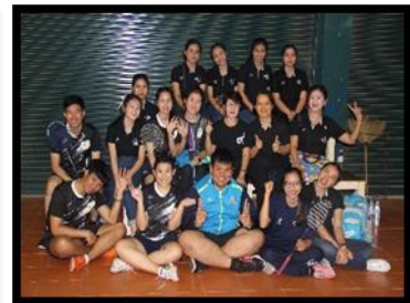
Figure 18: The annual sporting event organized by the Sports and personality development Club.

7. Aesthetic and hospitable environments – This includes the beauty and hospitality of the environment in the college, affecting the safety of the students. The beauty of the interior architecture of the College, the environmental aesthetics surrounding the college, lies on the enhancing of student learning, interactions between peers and teachers.